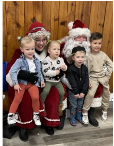
All photos taken during the event may be found on Livinginthenews.com